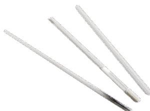
4 mm outer diameter sample tube, flat cell