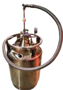
Liquid nitrogen variable temperature