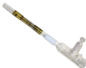
Liquid nitrogen dewar