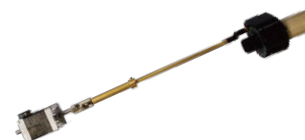
Automatic corner device